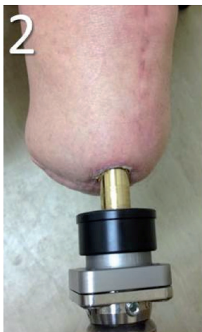
Figure 3. Skin-implant interface for case 2.

degrees. The implants were stable and well aligned (Figure 4C). All patients had complete healing with no discharge at the 3-month follow-up, and none of the cases presented with granulation tissue (Figure 3). Only case 3 had 1 episode of superficial infection and a broken bushing (external abutment).