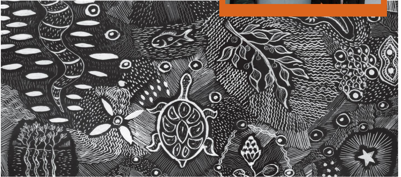
'Seeing Country' By Nyaparu Laurel 2012