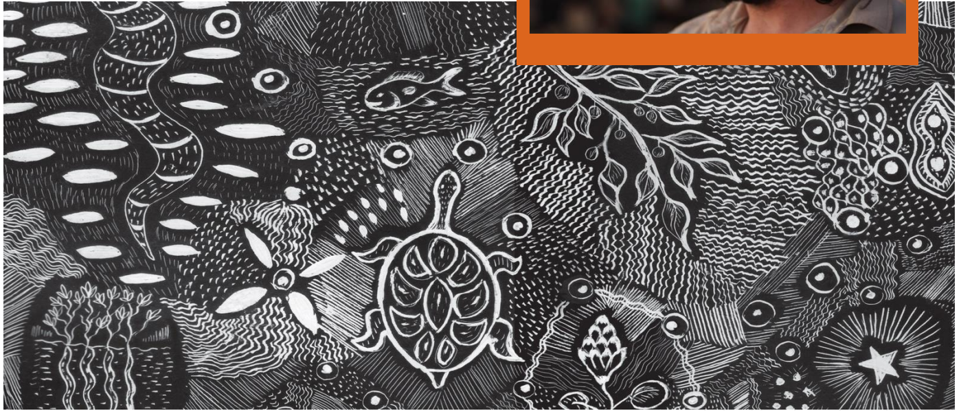
Artist: Yangkana Laurel, 2012