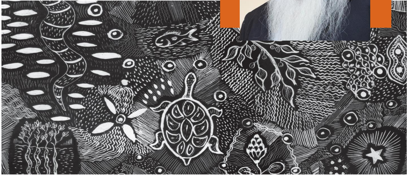
Artist: Nyapuru Laurel, 2012