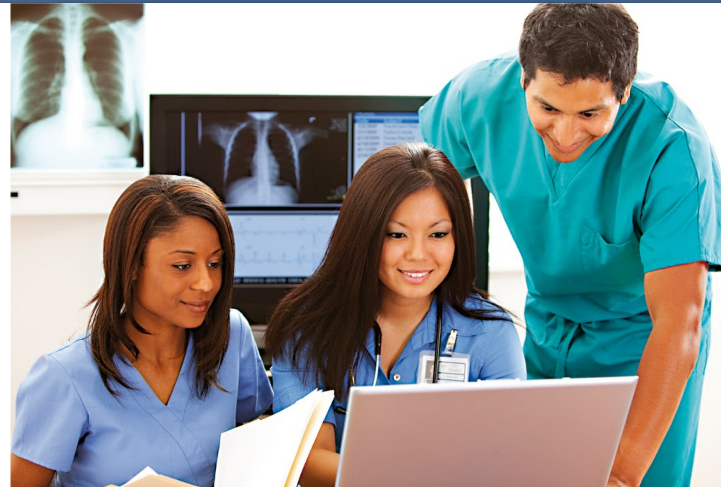
Table 1. Percentage of respondents in each discipline who selected guideline-consistent recommendations for physical activity, work and bed-rest in response to a vignette