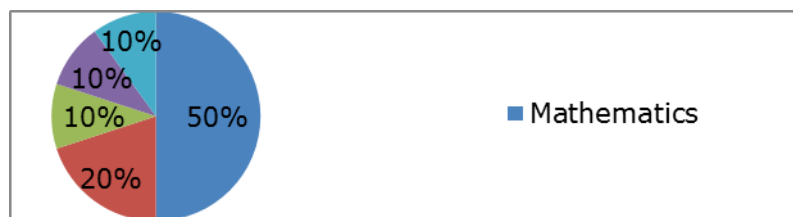
Figure 3: Undergraduate minor of participants